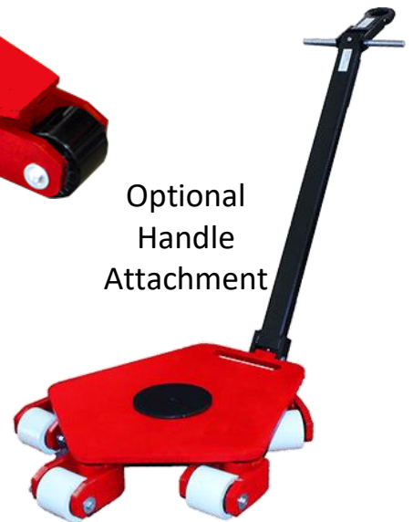
Optional Handle Attachment