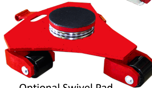
Optional Swivel Pad Attachment