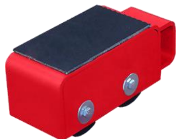
IFT2 & IFT-3