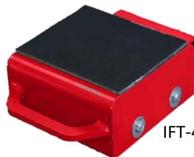
IFT-4 & IFT-6